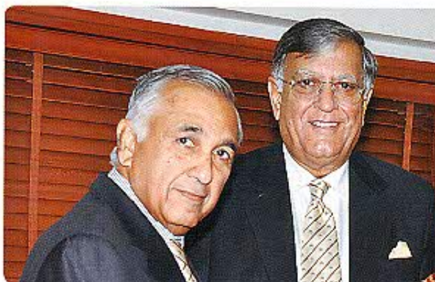
President and Captain