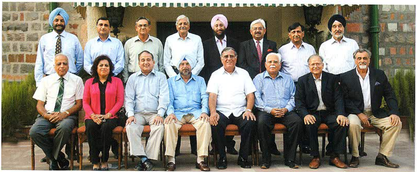
GENERAL COMMITTEE 2012-2013