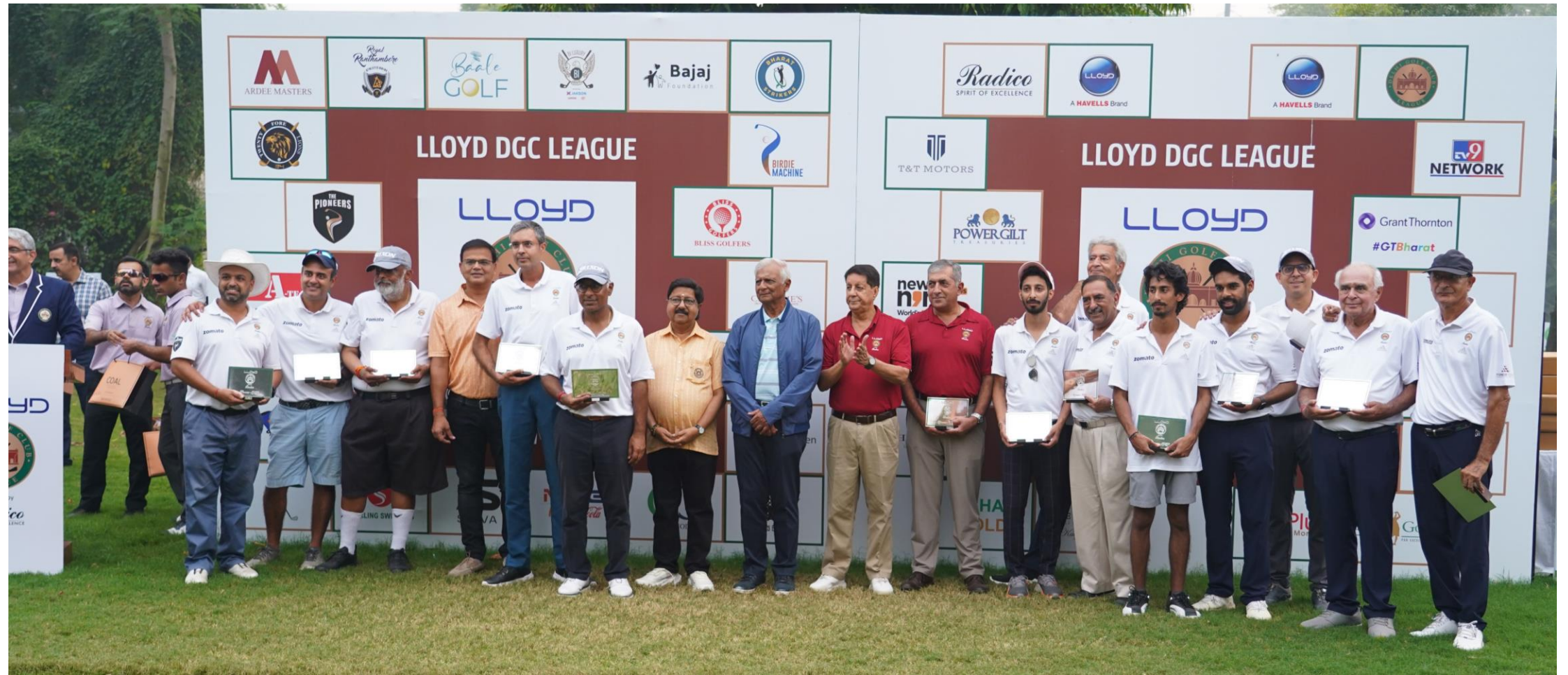
RUNNER'S UP TEAM - THE PIONEERS