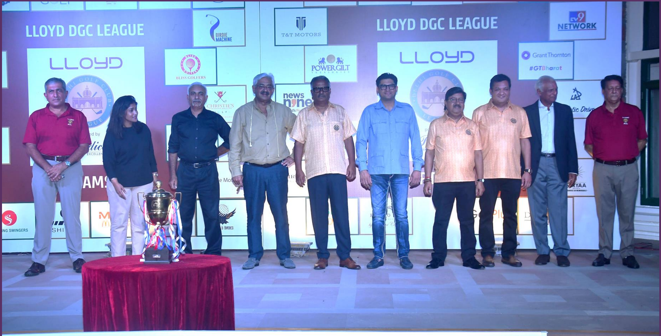
OUR SPONSORS DURING THE LAUNCH EVENING