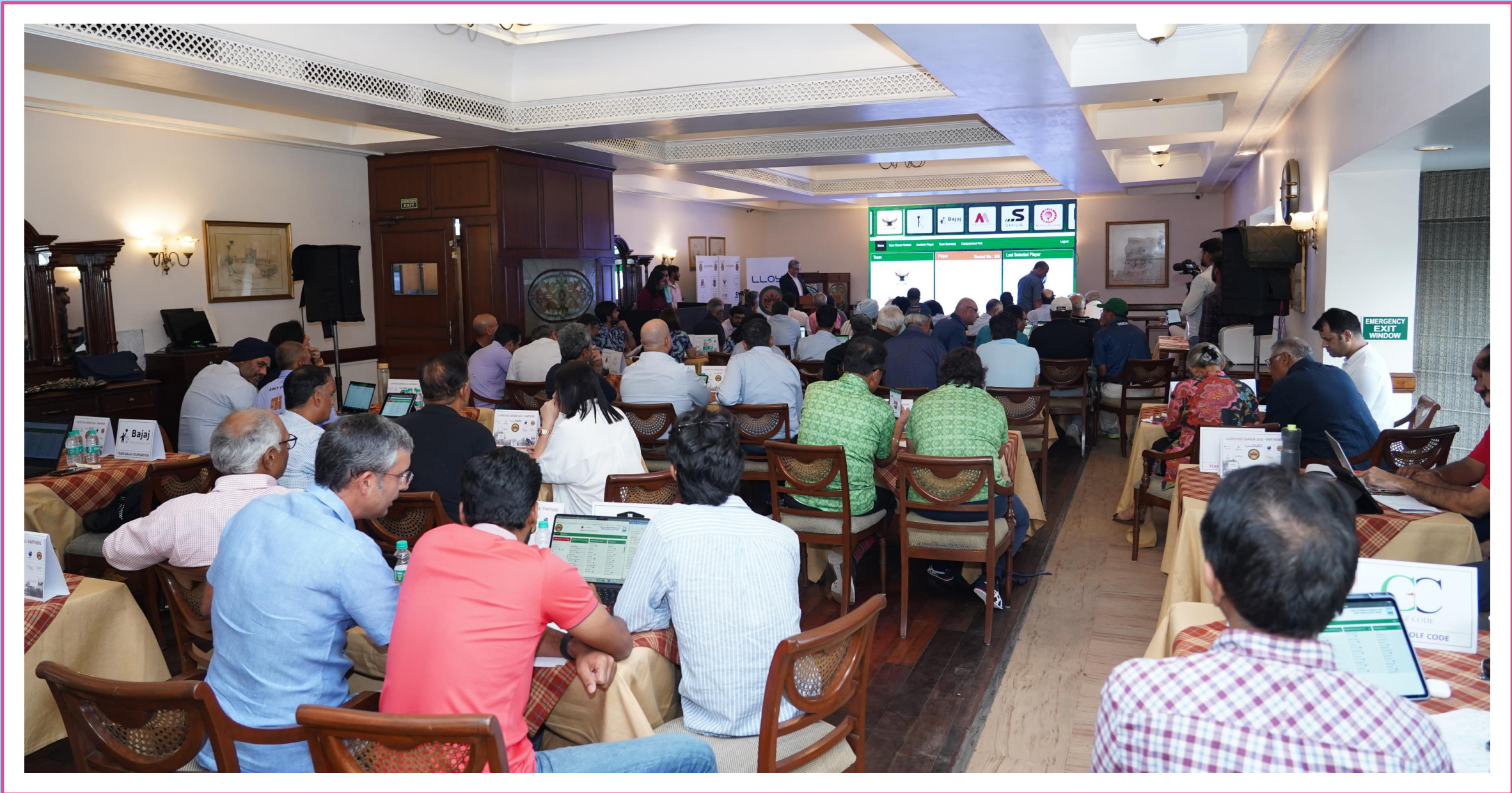
THE TEAM OWNERS DURING THE SELECTION EVENING